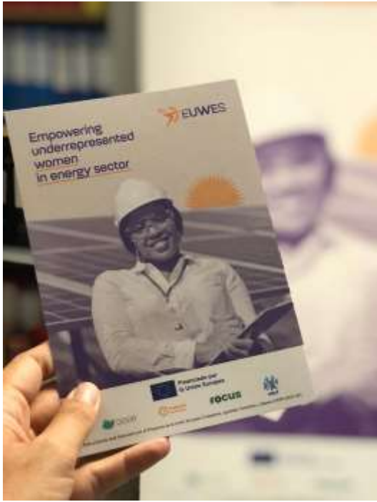
Slovenian language: 50 pieces